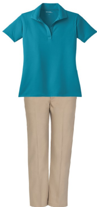
Life Enrichment (Teal / Tan)