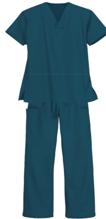
Nursing (Dark Teal)