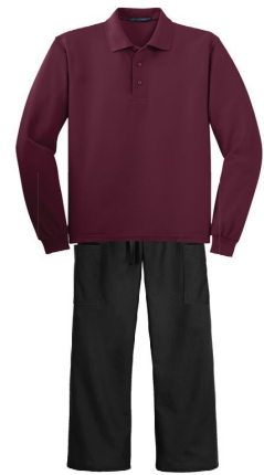
Transportation (Burgundy / Black)

We're here to provide radiant hospitality!