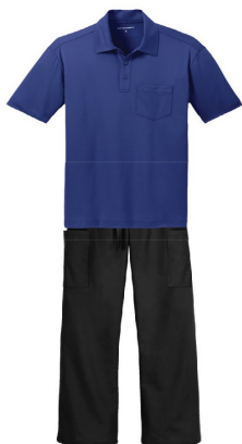
Housekeeping & Porters (Royal Blue / Black)