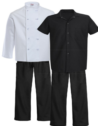
Cooks & Diet Aides (White / Black) Servers (Black)