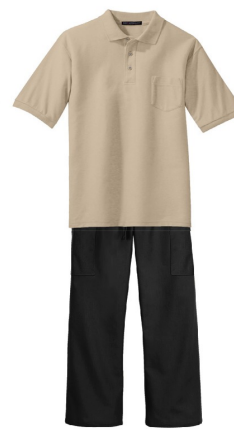
Maintenance (Tan / Black)