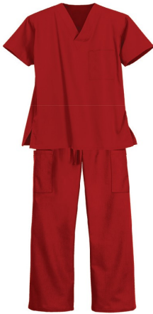
Assisted Living & Memory Support (Red)