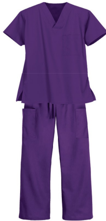
Community Services Home Healthcare, Home Services, Hospice (Purple)