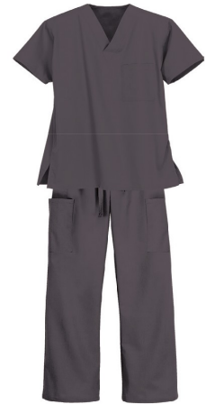
Therapy (Steel Grey)